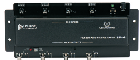
IF-4 AUDIO INTERFACE ADAPTER (four audio inputs and outputs)