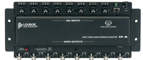
IF-8 AUDIO INTERFACE ADAPTER (eight audio inputs and outputs)