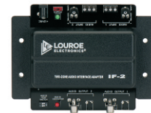
IF-2 AUDIO INTERFACE ADAPTER (two audio inputs and outputs)

These three units also contain individual "audio level control" potentiometers for audio gain adjustment. Output from the Louroe microphone can be increased 10dB or decreased -30dB.